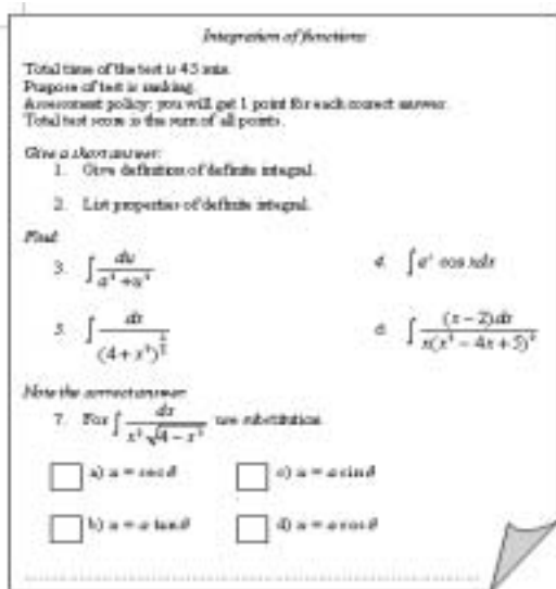
Fig. 2: An example of a test (fragment).